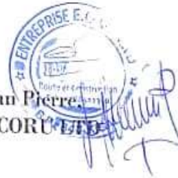
Figure 4: ECORU LTD_Attestation